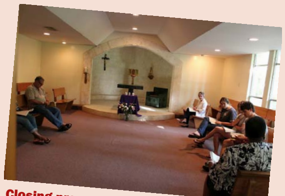
Closing prayer service in the chapel to end our time together in Miami