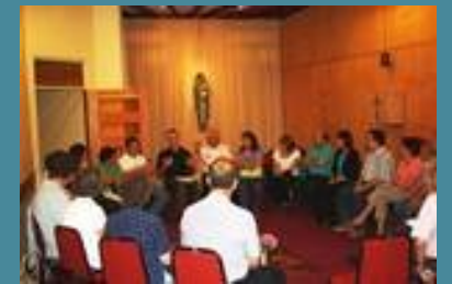
Precious Blood Ministry of Reconciliation Training Circle meeting.

Precious Blood Ministry of Reconciliation (PBMR) is a not-for-profit organization that reaches out to youth and family in the Back of the Yards/Englewood community in Chicago, in particular those who are impacted by incarceration and conflict. We embrace two core values: hospitality and accompaniment.