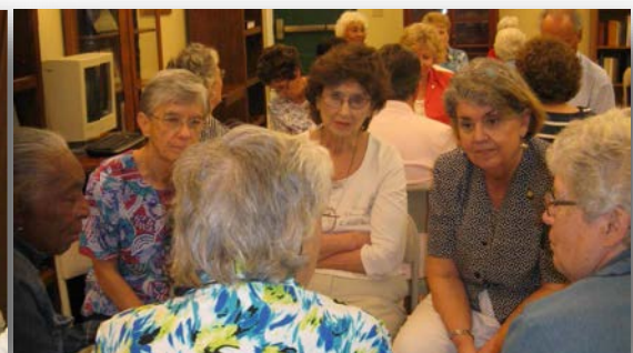
Associates and Sisters in dialogue