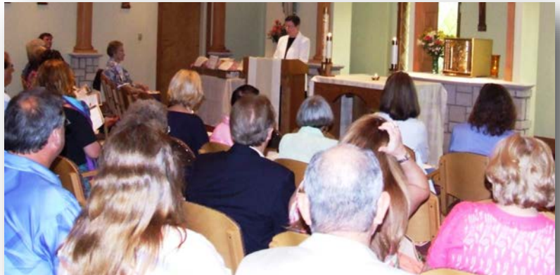
Associates during prayer