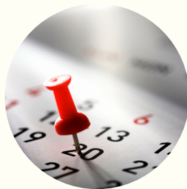
DIOCESAN BULLETIN IN SPANISH