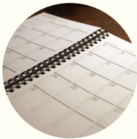
DIOCESAN LITURGICAL CALENDAR