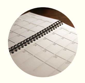
DIOCESAN Liturgical Calendar