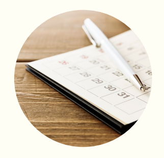
DIOCESAN LITURGICAL CALENDAR