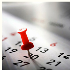
ANUNCIO DEL BOLETÍN DIOCESANO