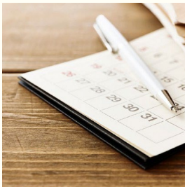
DIOCESAN LITURGICAL CALENDAR