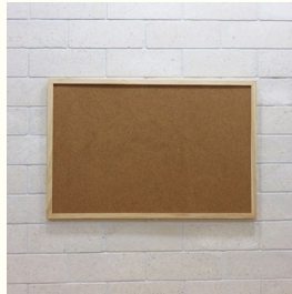
DIOCESAN BULLETIN ANNOUNCEMENTS